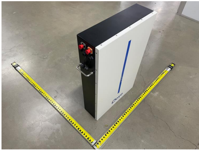
Battery/电池 (RW-M6.1 51,2V 120Ah 6,14kWh)